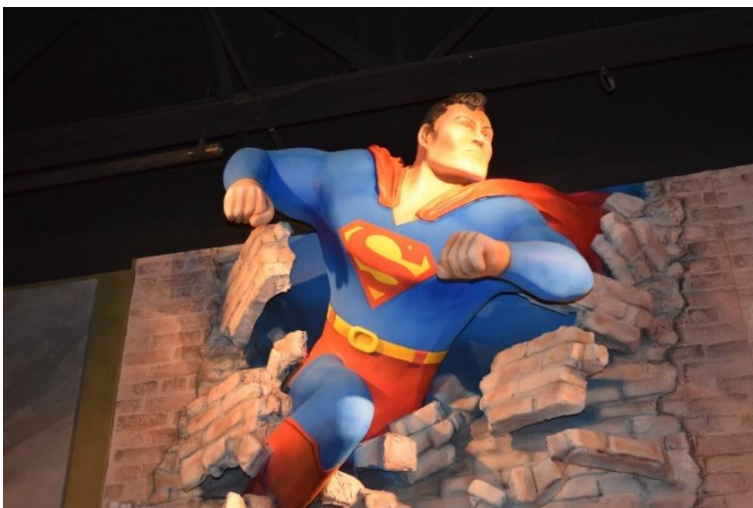
Maltz Museum of Jewish Heritage

Shuster later joined Siegel in San Diego, moving in across the street and harkening back to their high school days. In 1975, Siegel and Shuster sued DC Comics for a share of the profits once again. They lost this case, but DC Comics agreed to pay each man a yearly stipend of thirty-five thousand dollars. The company also gave credit for Superman's creation to the two men. Siegel died on January 28, 1996. In 1999, the Siegel family successfully won a court case, granting the family fifty-percent ownership of the Superman character.