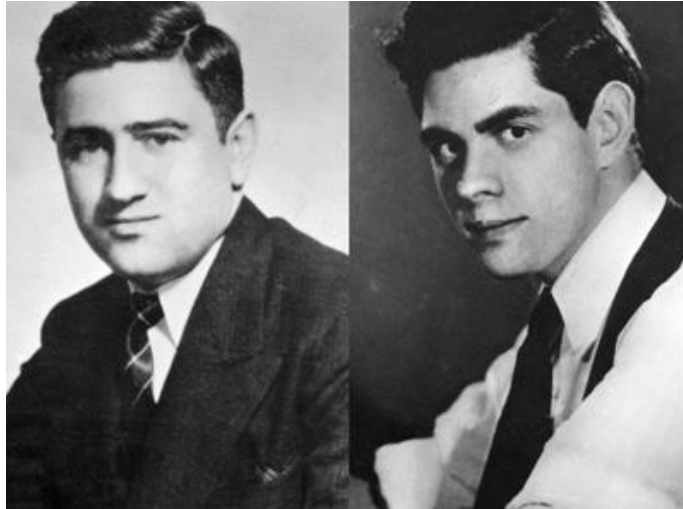
Jerry Siegel (left) and Joe Shuster (right)

Jerry Siegel and Joe Shuster were both born to Jewish immigrants.